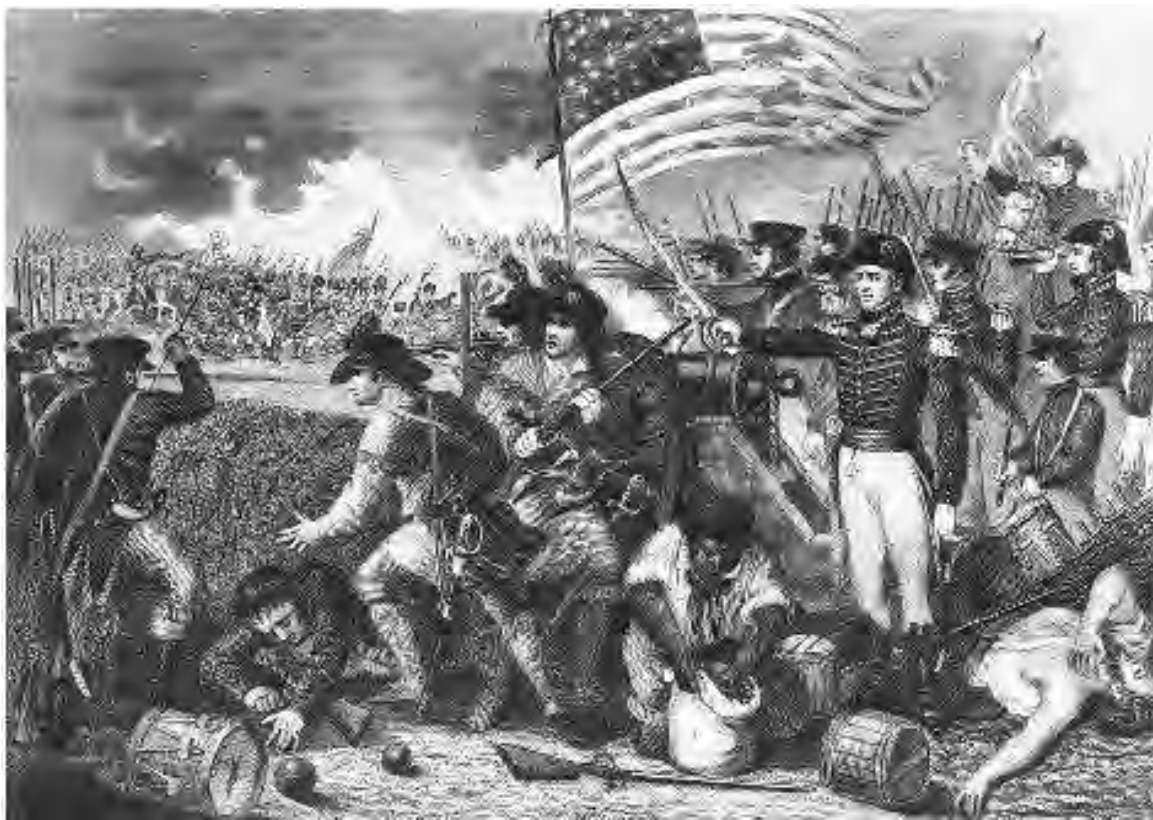
Andrew Jackson at the Battle of New Orleans, 1815

We look forward to welcoming you to La Crosse!