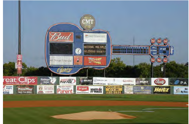
Greer Stadium scoreboard, Nashville