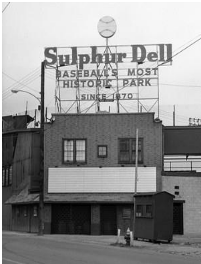
Sulphur Dell Park, 1932