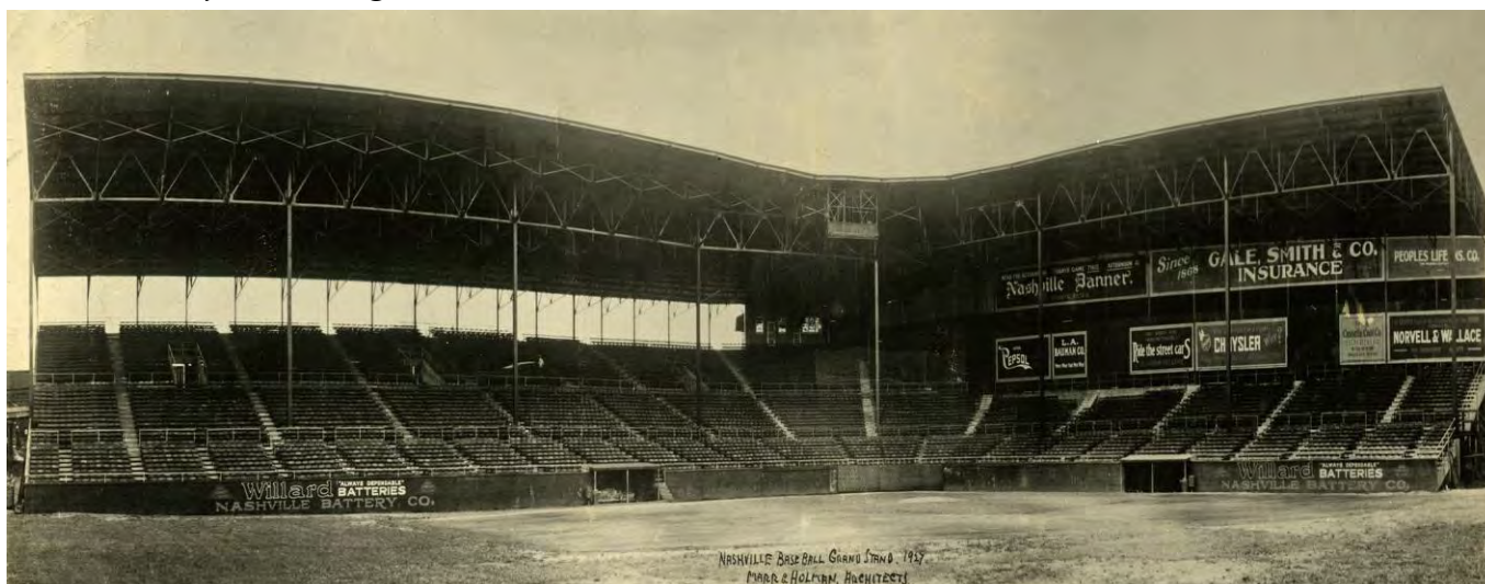
Sulpher Dell grandstand, Nashville, 1927

Arthur H. Cole Prize is awarded annually by the Editorial Board of the JEH for the best article in the previous year's volume of the Journal .