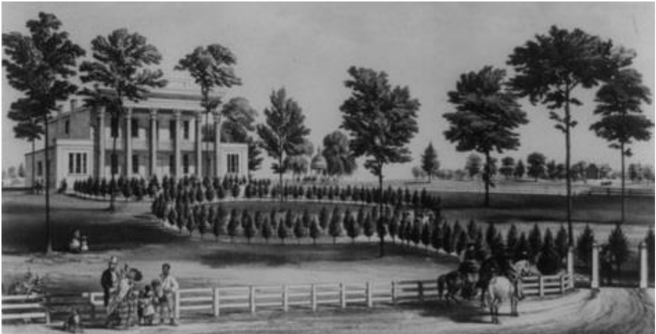
The Hermitage, 1856

“Directed Technical Change, Lock-in and Leapfrogging: Wood vs. Iron in the 19 th Century Shipbuilding Industry.”