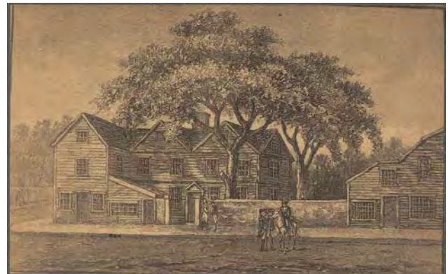
The Liberty Tree

Who Was Who 1971-80 , vol VII, Adam & Charles Black, London, 1981