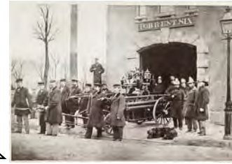
Eustis St. Firehouse 1859