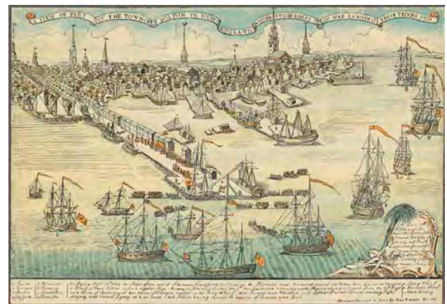
British warships arrive in Boston 1768