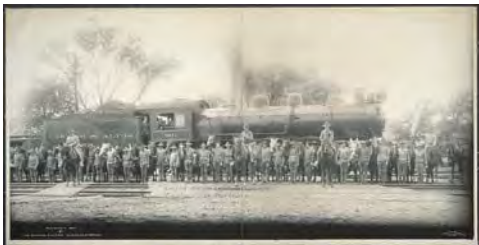
World's largest engine, Chicago & Alton RR 1907