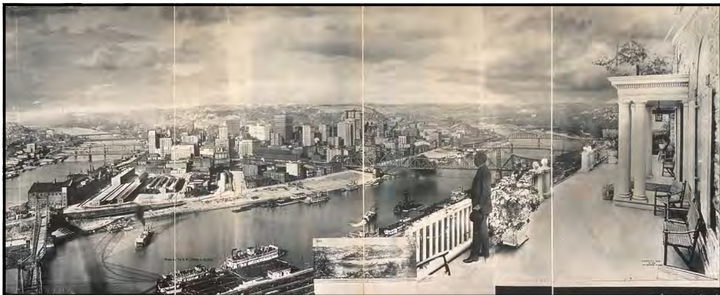
Official sesquicentennial photograph of Pittsburgh, taken in 1909