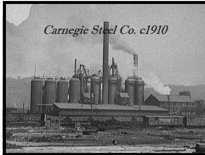
Carnegie Steel Co. c1910