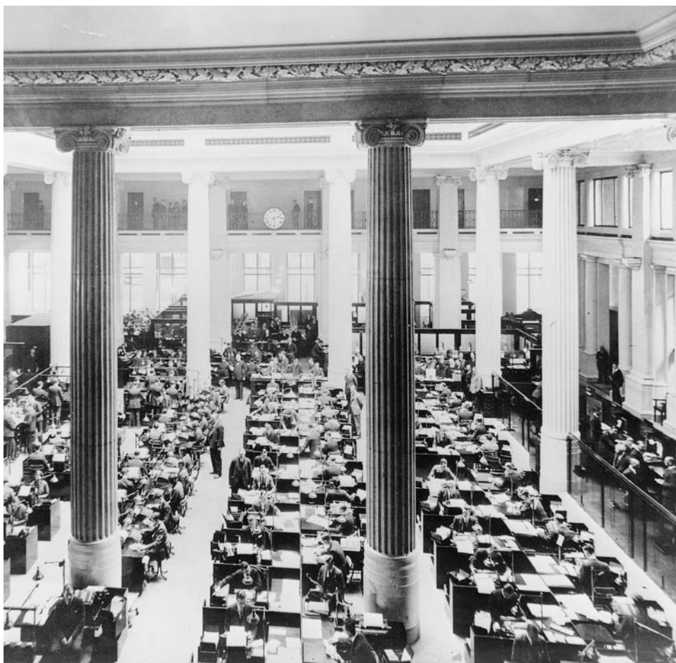
Figure 4. Machine banking in inter war Britain: the central banking hall at Lothbury after the mechanisation of the Westminster Bank's headquarter functions.

It was the branch where most customers came into contact with the bank's staff. Only the most important clients had dealings with head office which scrutinised all major loans