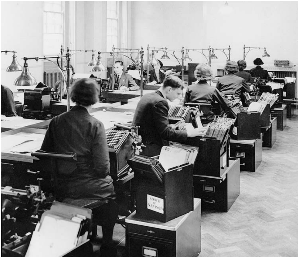
Figure 8. Mechanised banking at the Leicester Branch of the Westminster Bank, circa 1938.

labour force and the working environment. 66 Although this picture undoubtedly over-romanticises the lost gentlemanly attitude to female clerks, clearly the implications of women workers becoming extensions of a machine was evident to all bank workers. Second, issues of control and supervision of a branch bank are raised in Figure 6. Here representatives from headquarter offices, senior staff employed in the Inspection Department, appear as technicians arriving to scrutinise and fine-tune operation of a mechanical banking system at the local level. Finally, there were the customers. In addition to their own trepidations concerning change at work, bank workers were well aware of public anxiety concerning mechanisation. 67 This apprehension was not confined to aspects of security nor to the accuracy of record-keeping. In Figure 7 an attempt to defraud a branch with a forged cheque has shocking consequences – but the cartoon also carries the implication that impersonal service threatened to damage the personal relationship which so many customers valued highly. As these cartoons so clearly illustrate, recognition of the cost cutting aspects of bank mechanisation alone would represent a failure to appreciate the far-reaching impact of this managerial and technical transformation.