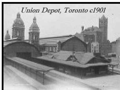
Union Depot, Toronto c1901