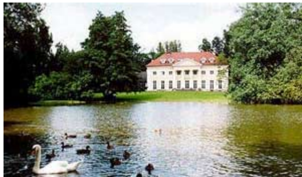
Evangelische Akademie, Schloss Schönburg, Hofgeismar