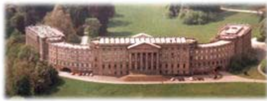
Schloss Wilhelmshöhe, Kassel